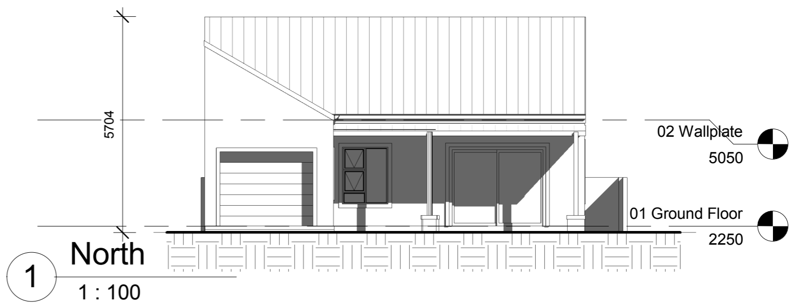
1 North 1 : 100