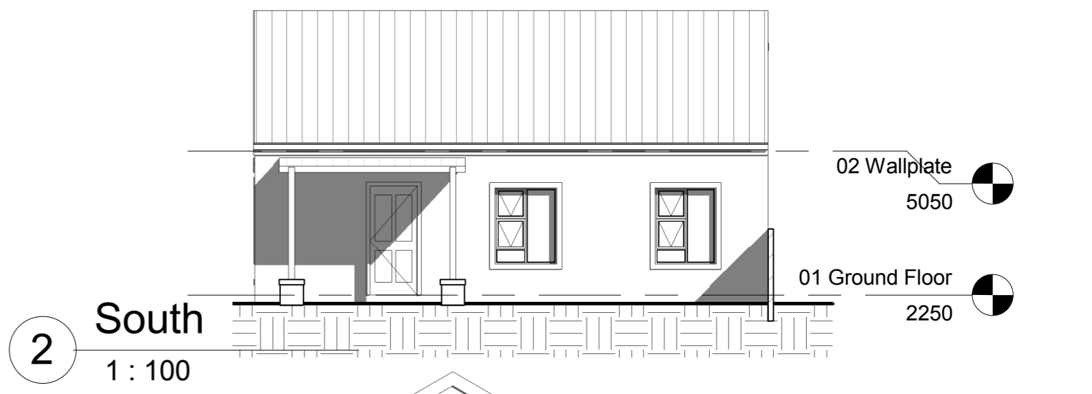
2 South 1 : 100