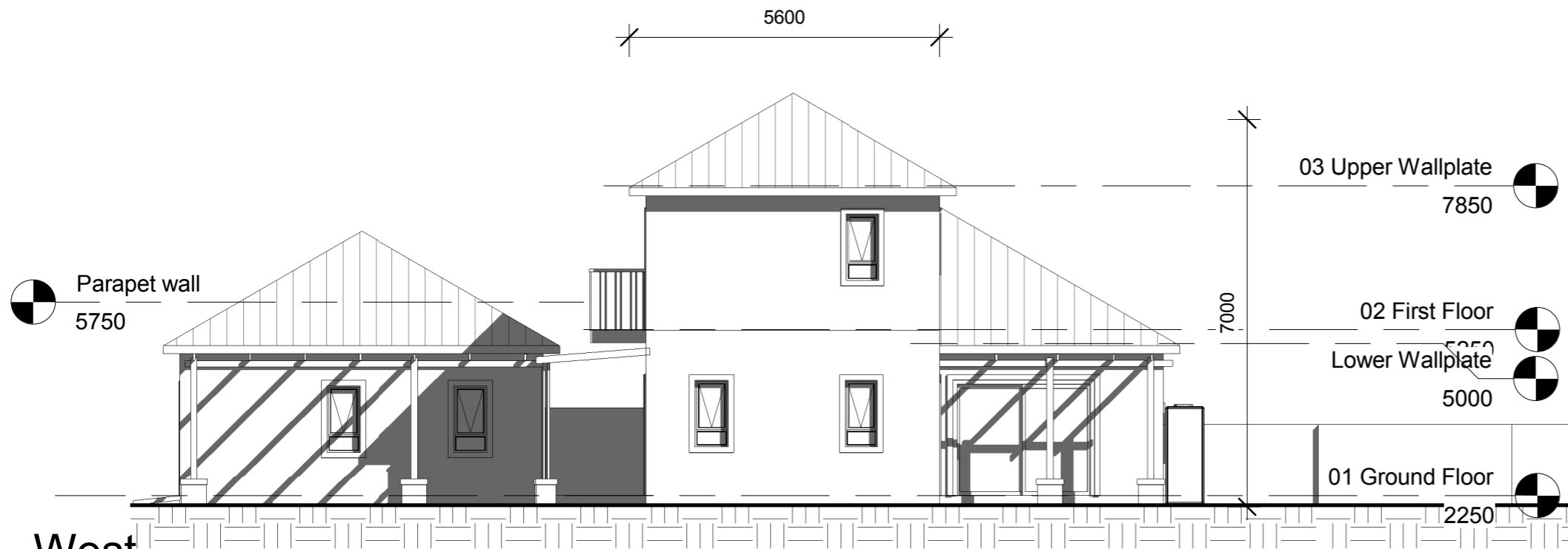
3 West 1 : 100